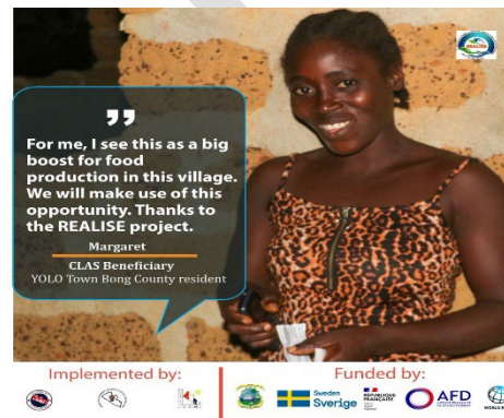
Figure 1: CLAS Beneficiary.

This project aims to increase access to income-earning opportunities for the vulnerable in the informal sector in response to crises, expand income and livelihood support to poor and food insecure households, and improve efficiency in managing social protection programs in Liberia. The project will reach 15 counties, targeting grant support to households to revive small businesses; labour-intensive public works and employability support; community development and agriculture support; systems building for targeting and social cash transfer; and capacity building, project implementation and coordination. Overall, 45,650 vulnerable households will benefit directly, translating to about 228,250 vulnerable individuals.